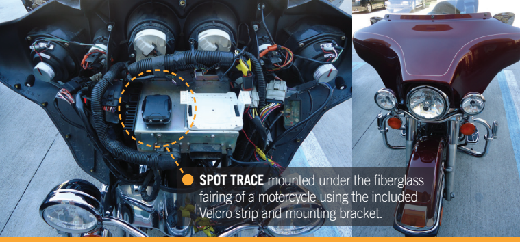
● SPOT TRACE mounted under the fiberglass fairing of a motorcycle using the included Velcro strip and mounting bracket.